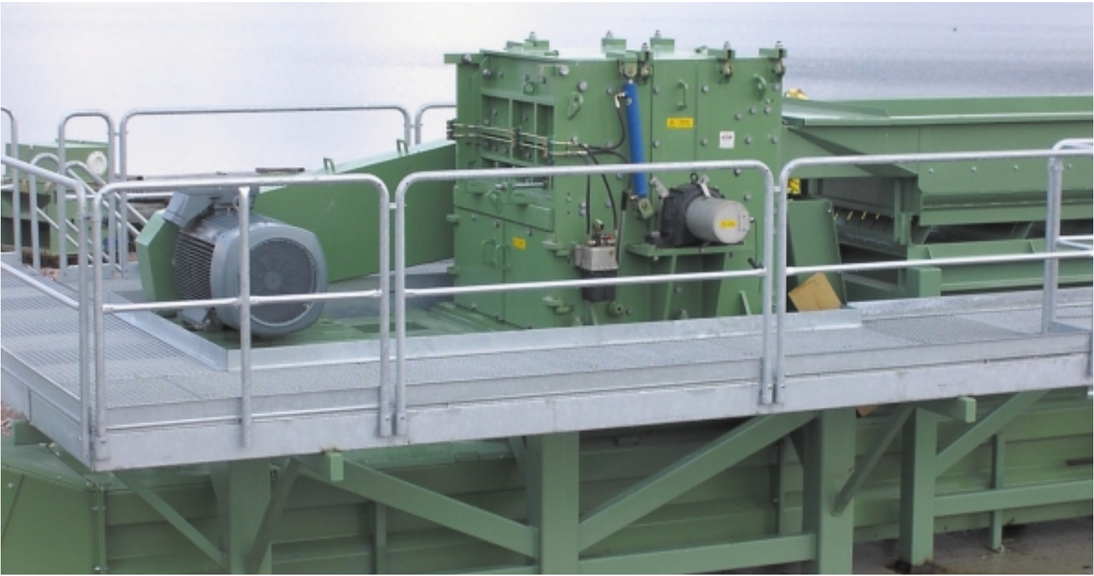
Horizontally-fed bark hog