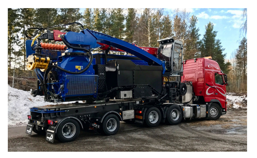
MOBILE CHIPPER 1006.2 ST