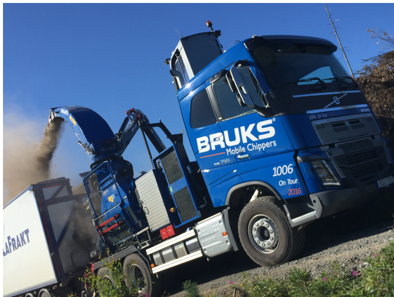
MOBILE CHIPPER 1006 PT TRUCK