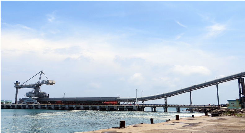
IDLER BELT CONVEYORS